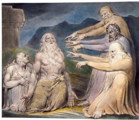
Job Rebuked by His Friends.